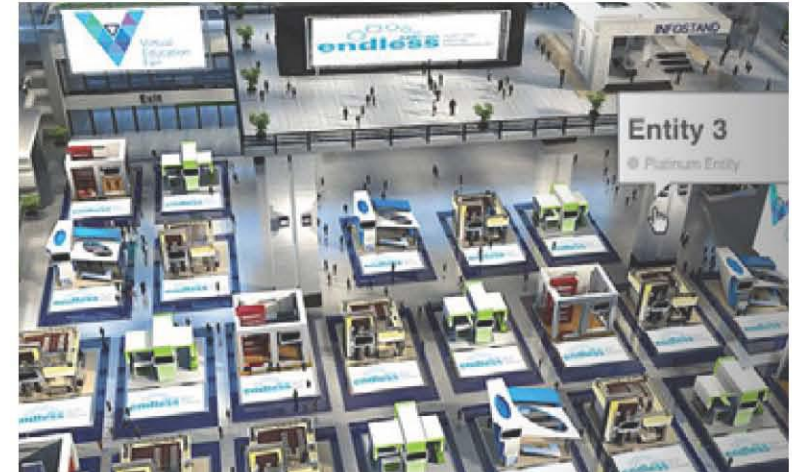
IDA 2021 Online Exhibition Hall (example)