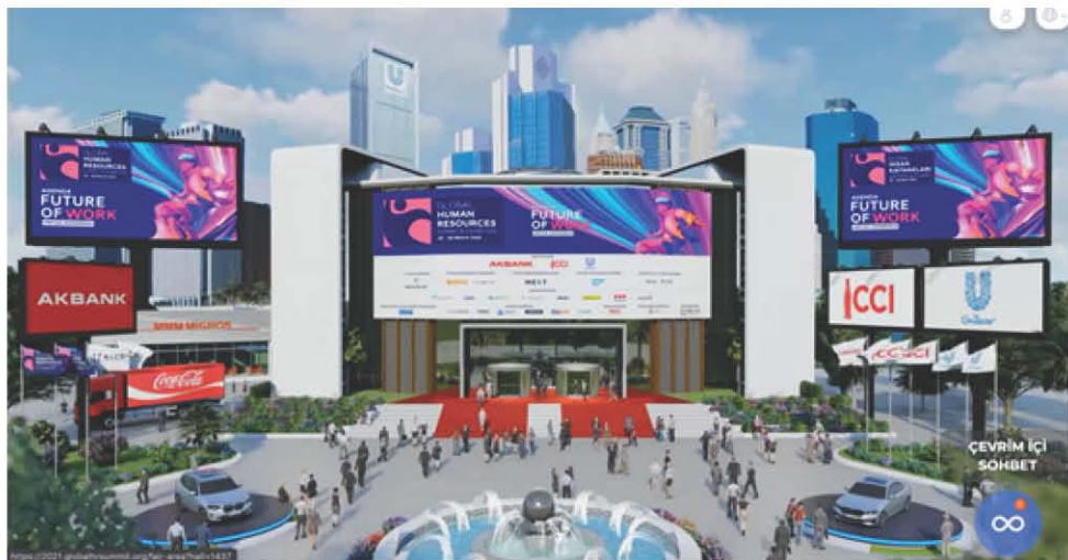
IDA 2021 main landing page with sponsor logos (example)

Please get in touch if you are interested in one of our sponsorship packages with additional pre-event, event and post-event marketing measures.