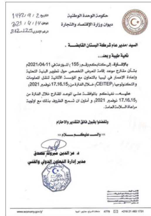
Invitation letter by the Libyan Government

ITIDA has been invited by the Libyan Government to concentrate its first online trade fair on "Reconstruct Libya". Many Libyan companies and decision makers will be obliged to visit the trade fair.